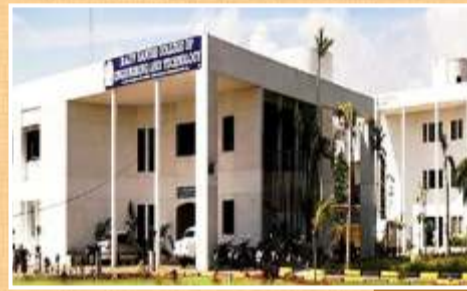
Rajiv Gandhi Engg. College (1.2 Kms)