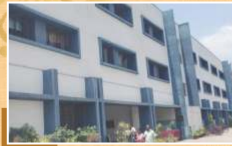
PSBB Millennium School (Less than 2.5 Kms)