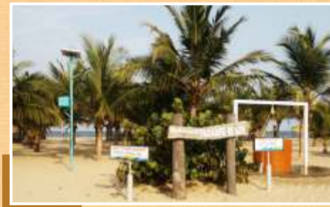
Pondicherry Tourism Spot Beach Paradise (3 Kms)