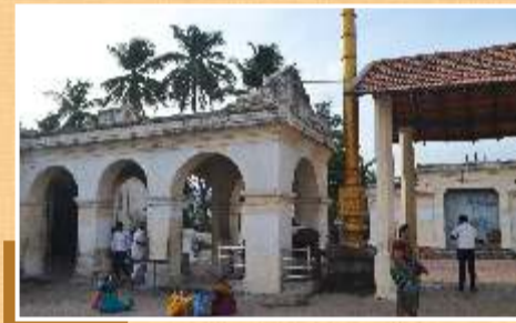
1200 years old Sivan Temple at Bahour (1.5 Kms)