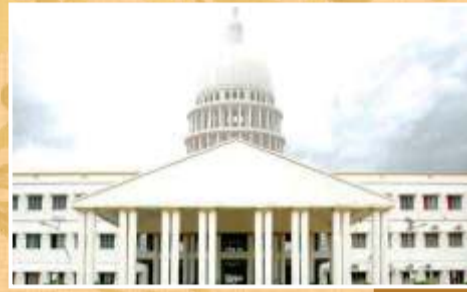
Aarupadai Veedu Medical College (1.5 Kms)