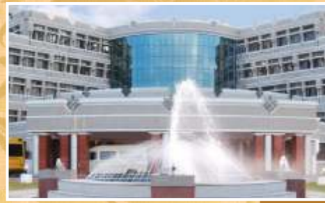
Mahatma Gandhi Medical College (Less than 1 Km)