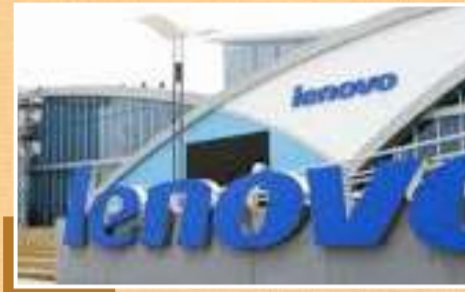
Lenovo Manufacturing Unit (2.8 Kms)